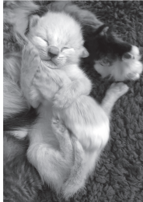
The world's best “shelter-in-place”

Spring is a critical time for trappers trying to prevent cat pregnancies. During the shutdown, our spay/neuter hospital in Clayton was one of the few non-profits still open for business – and business was brisk. After closing for just 10 days in March to develop COVID safety protocols for staff and clients, we kept up our 4-day-a-week schedule, performing 1688 spays and neuters through August, a 20% increase over a year ago.